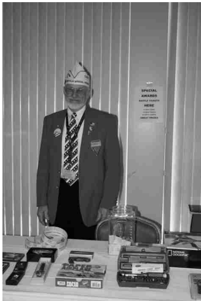
July 17, 2009 - 40 & 8 Meeting - McClellan, CA